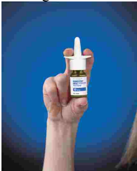
7 Figure C