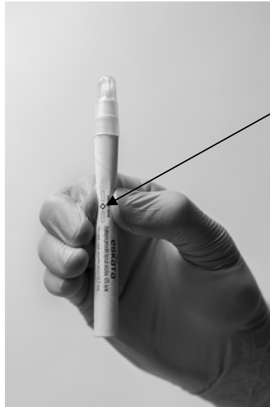
Step 2: Crush the ampule in the applicator by applying finger pressure to the diamond symbol on the applicator barrel