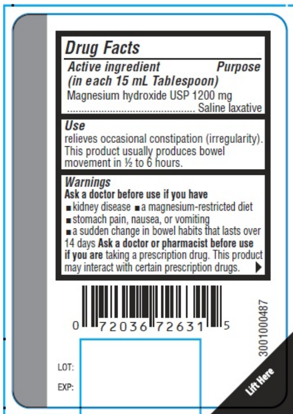
Top Ply (Page #1)